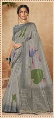
* 3705 *