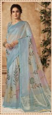
* 3706 *