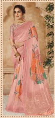
* 3704 *