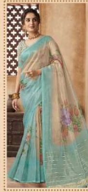
* 3708 *