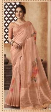
* 3709 *