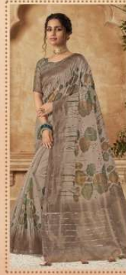
* 3711 *