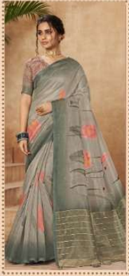
* 3701 *