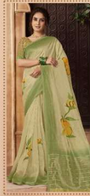
* 3710 *