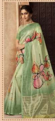
* 3707 *