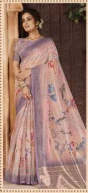
* 3702 *