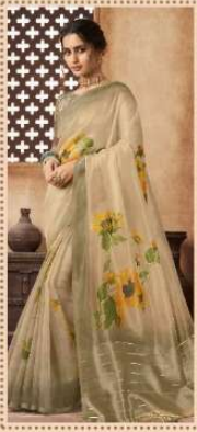
* 3703 *