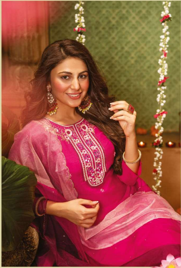
• Anything possible with a little lipstick and champagne