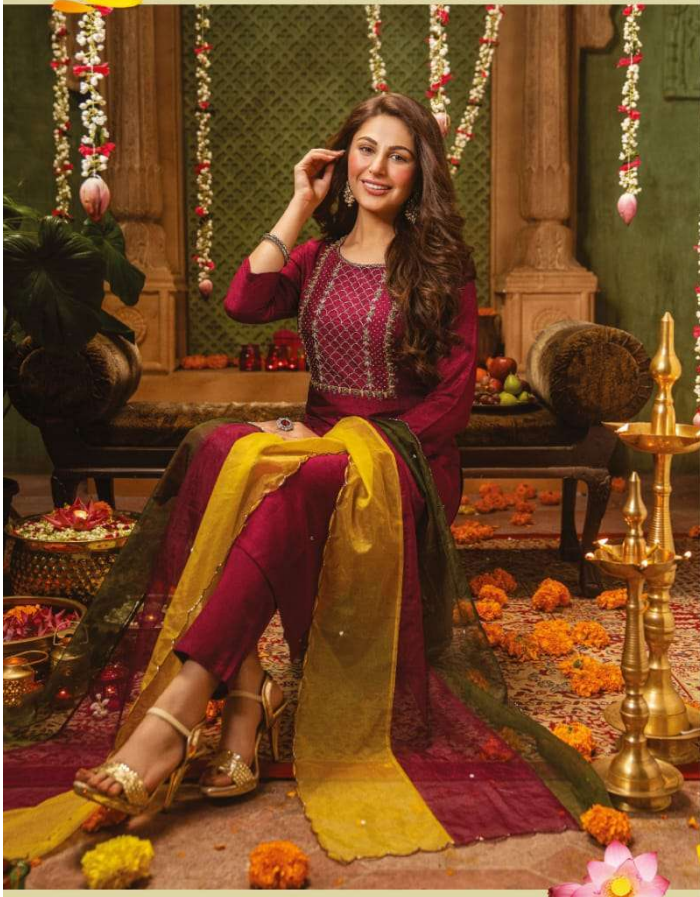
• Anything possible with a little lipstick and champagne