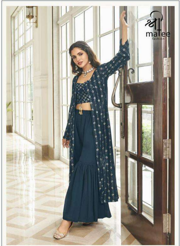
My fashion is about the urban woman in the year. I think about obscure, weird things and try to create a world around them CODE 134