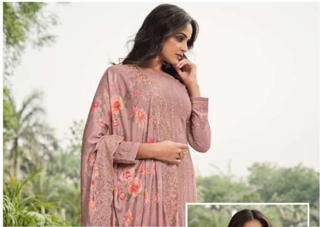
■ This season's blooming pieces for a radiant you!