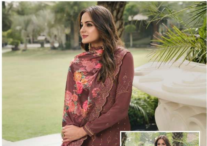
■ Hit refresh on your style with embroidered suit & print dupatta.