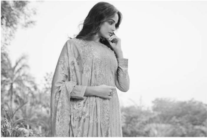
■ Bloom in florals this festive season with our most graceful separates.