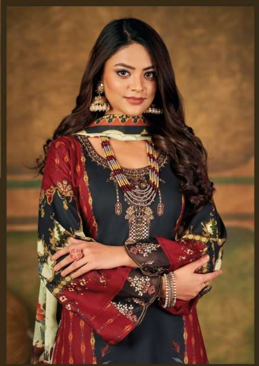
DESIGN NO 10001

Make everyday fashionable... a round up of the hottest trends for this seasons.