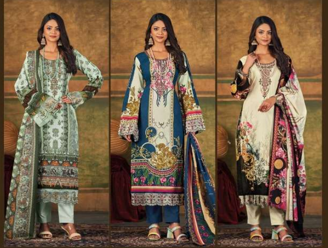
DESIGN NO 10004