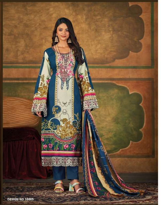
DESIGN NO 10005