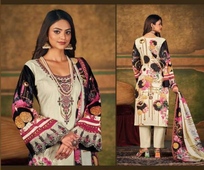
DESIGN NO 10006

the everyday fashionable... a round up of the hottest trends for this seasons.