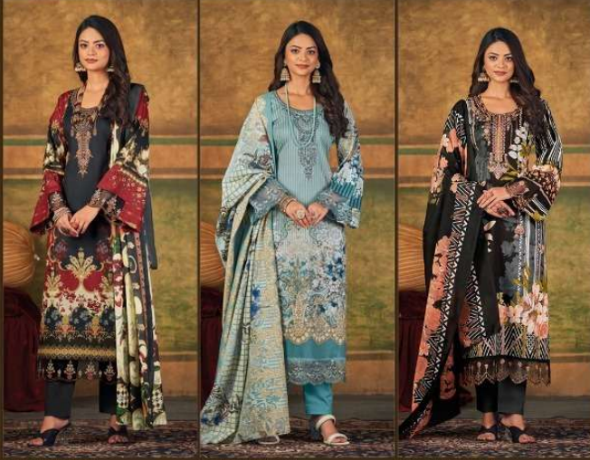
DESIGN NO 10001