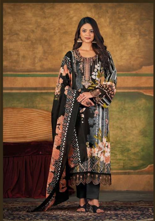
DESIGN NO 10003