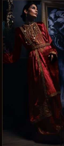
EOW | 04