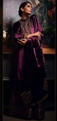
EOW | 06