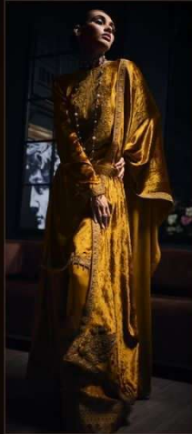
EOW | 03