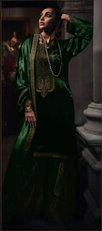
EOW | 01