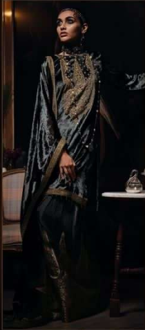
EOW | 02