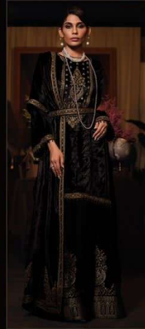
EOW | 05