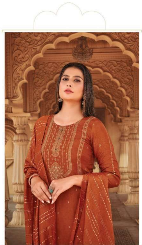
Classic style with luxurious softness highlighted by refined and feminine details