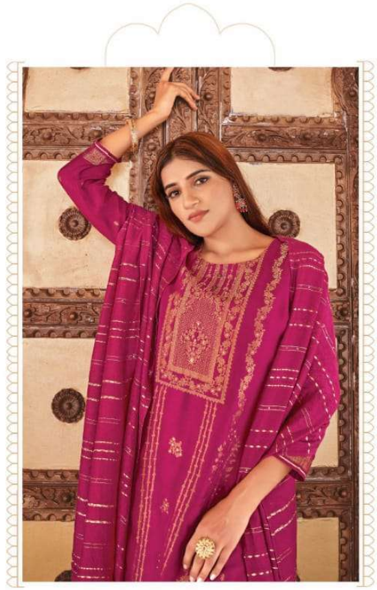
like shisha bold patterns & sumptuous detailing adorns modern silhouette