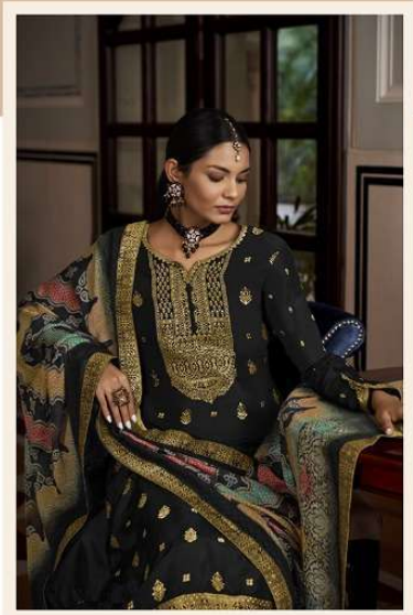
MANDAKINI | 7008