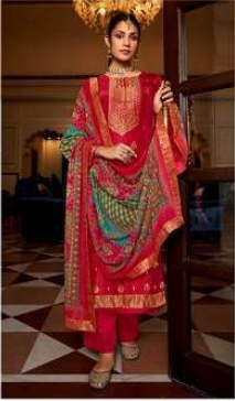
MANDAKINI | 7003