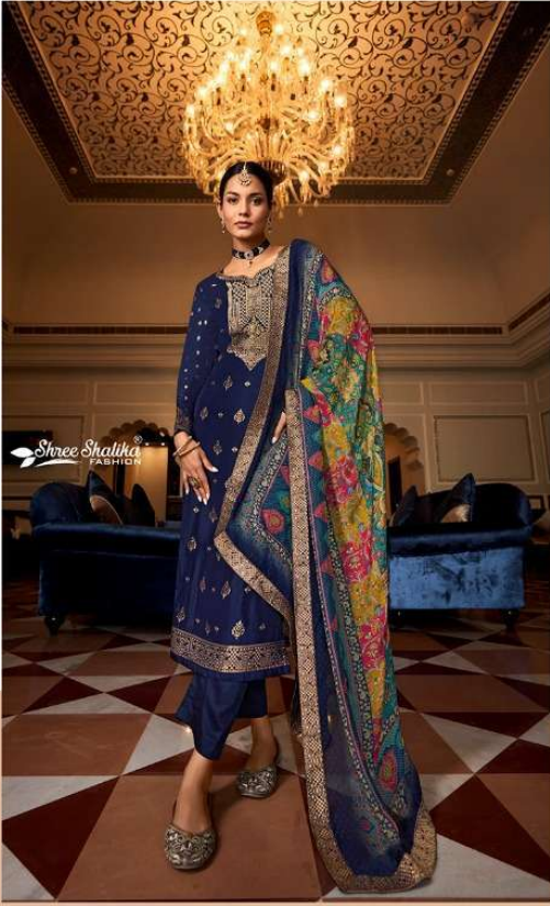
MANDAKINI | 7006