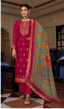
MANDAKINI | 7005