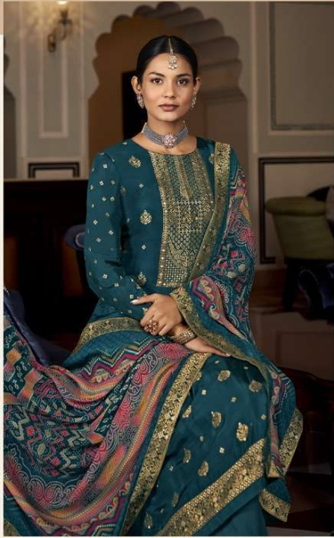
MANDAKINI | 7004