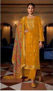
MANDAKINI | 7007