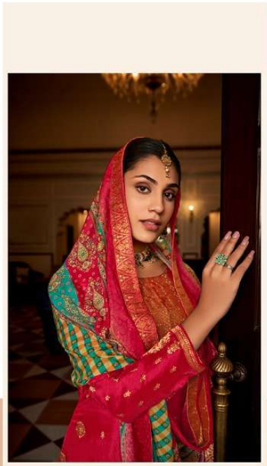
MANDAKINI | 7003