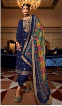
MANDAKINI | 7006