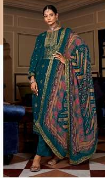
MANDAKINI | 7004