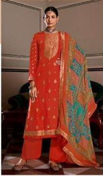
MANDAKINI | 7001