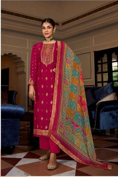
MANDAKINI | 7005