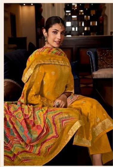
MANDAKINI | 7007