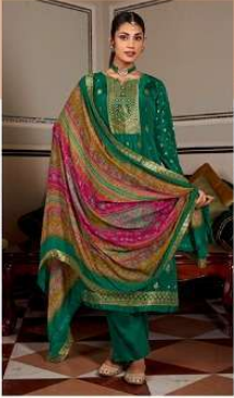
MANDAKINI | 7002