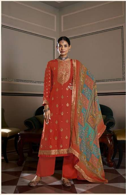
MANDAKINI | 7001