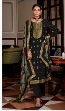
MANDAKINI | 7008