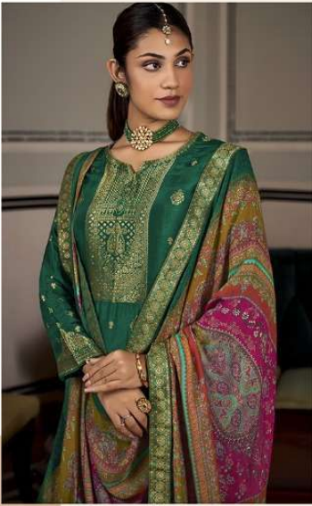
MANDAKINI | 7002