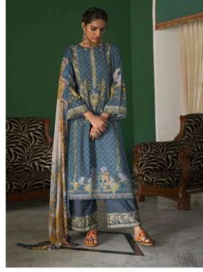
D. No. 8885