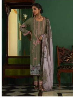
D. No. 8882