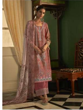
D. No. 8887