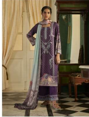
D. No. 8884