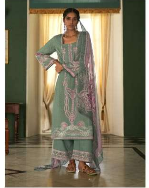
D. No. 8888