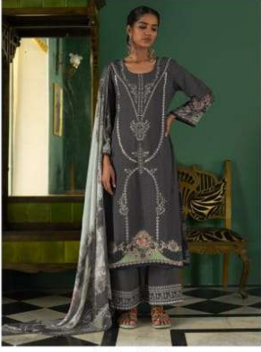
D. No. 8881