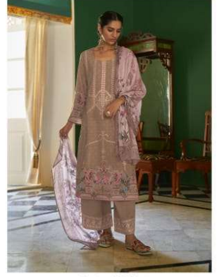
D. No. 8886