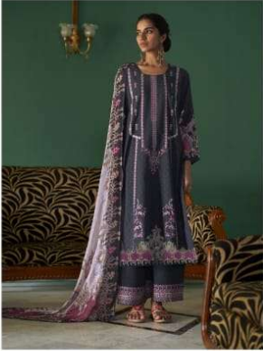
D. No. 8883