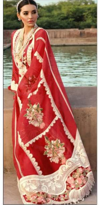
S - 85 H