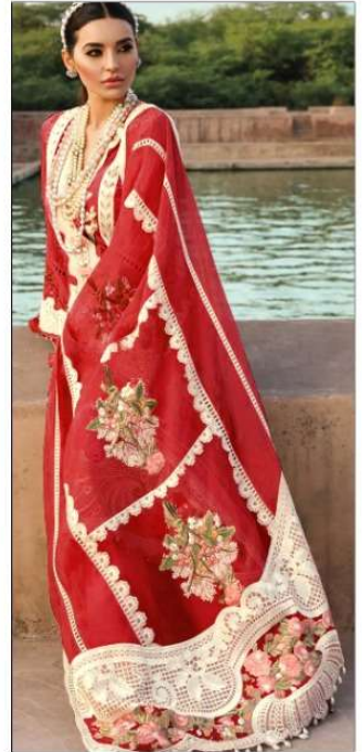
S - 85 H