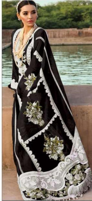
S - 85 G