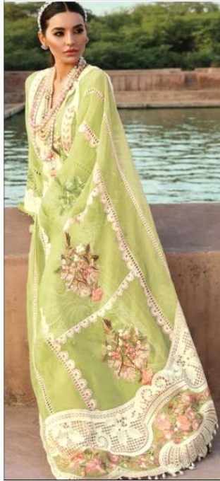
S - 85 F