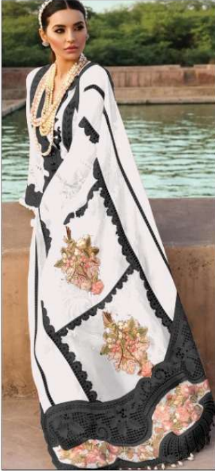
S - 85 E

Top - Lawn cotton heavy embroidered with neck emb patch Bottom - Semi lawn cotton Dupatta - Butterfly net heavy embroidered