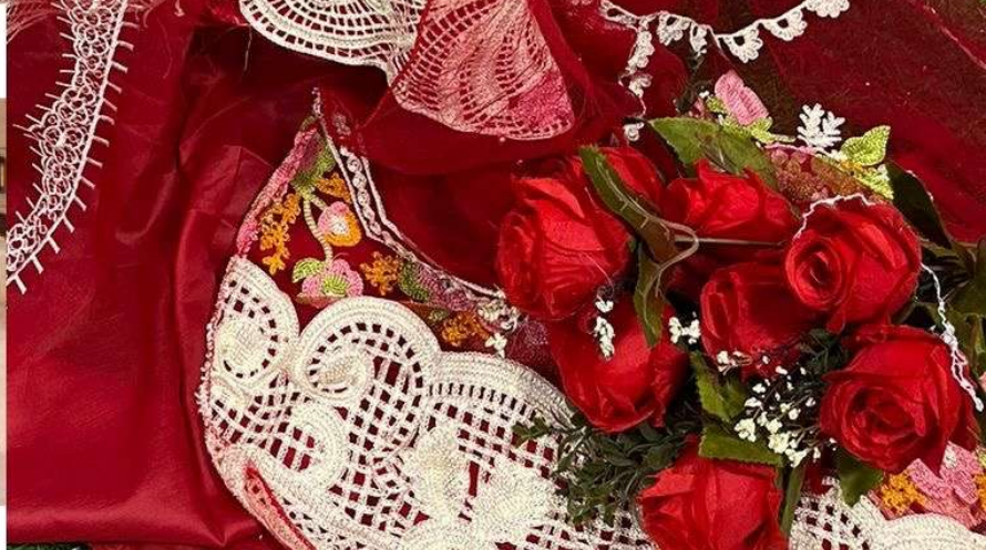
Top - Lawn cotton heavy embroidered with neck emb patch Bottom - Beni lawn cotton