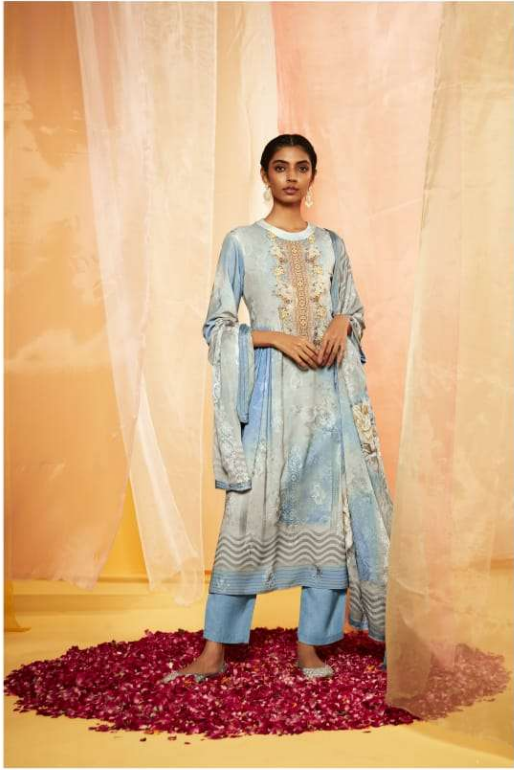
8866 FESTIVE COLLECTION 2022 2023