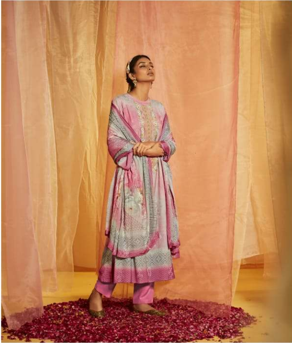
8865 FESTIVE COLLECTION 2022 2023