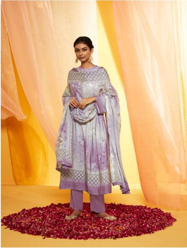
8861 FESTIVE COLLECTION 2022 2023