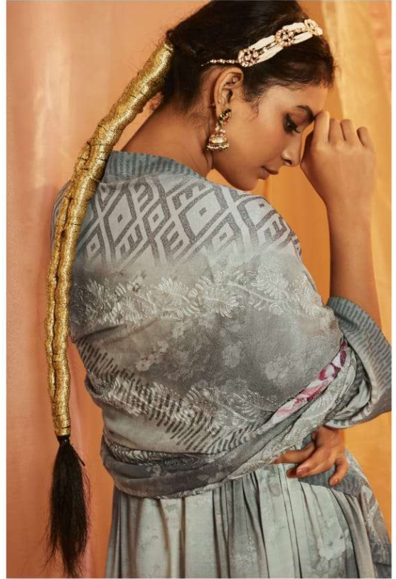
FESTIVE COLLECTION 2022-2023 8868