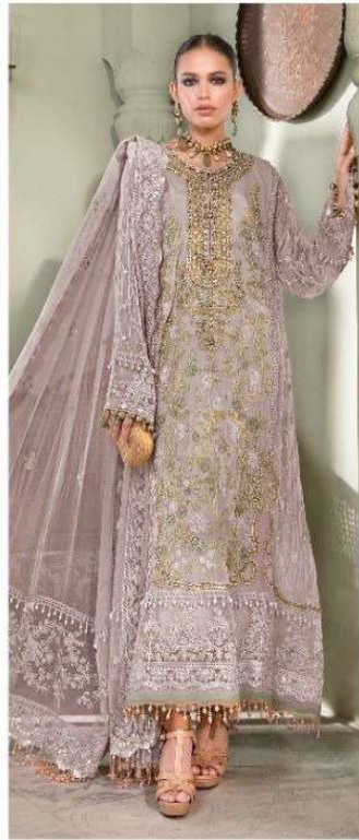
C - 1545 B