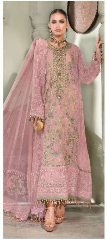
C - 1545 D