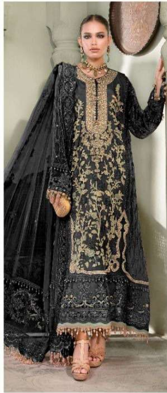
C - 1545 C