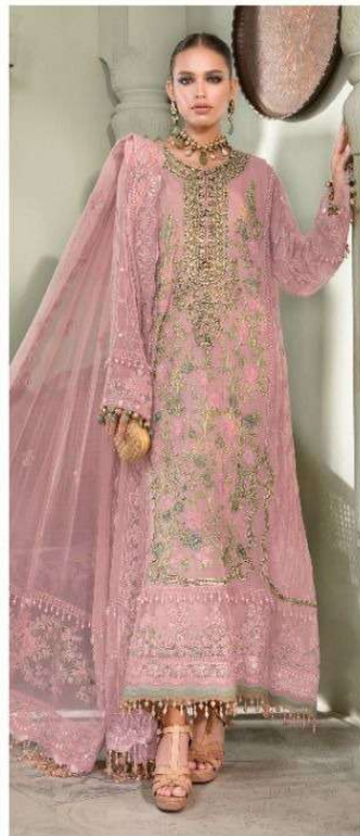
C - 1545 D