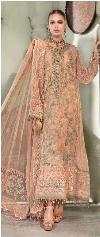
C - 1545