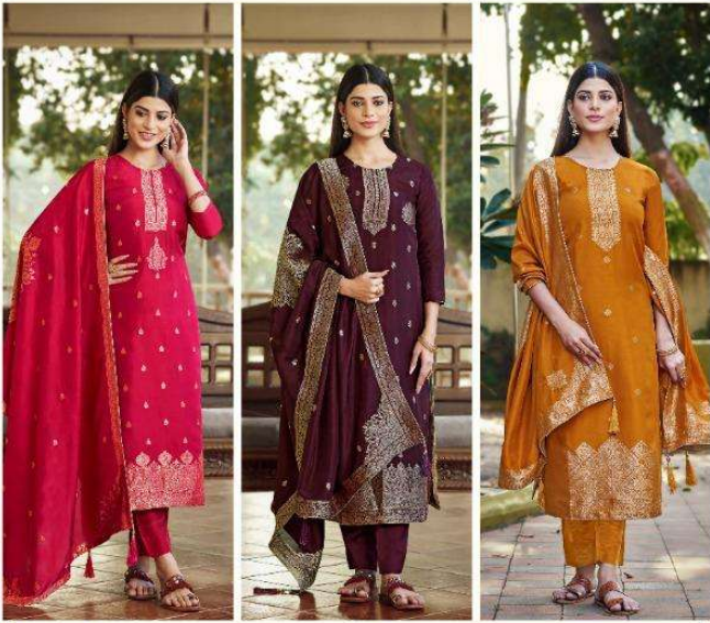
+ 332-001 +