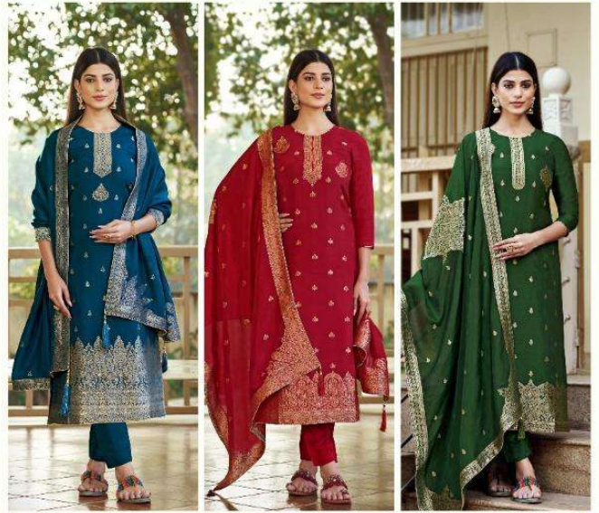
+ 332-004 +