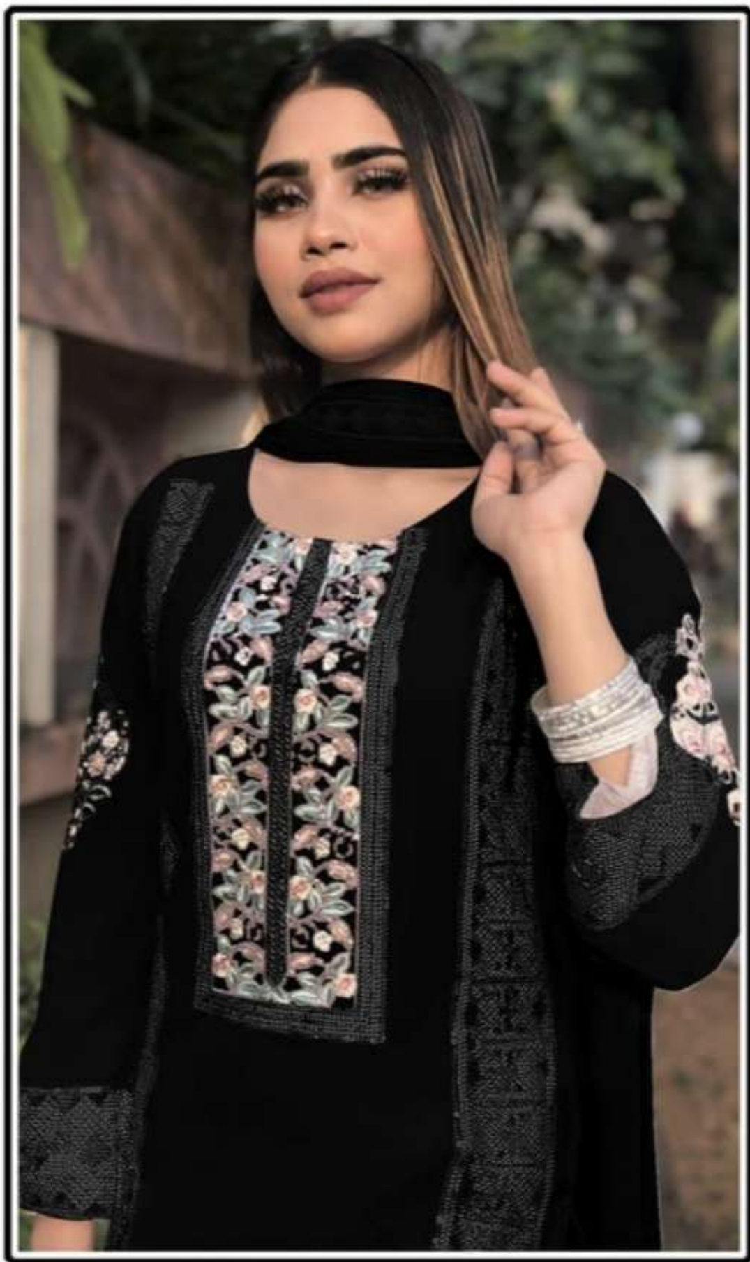
Rose S4 WEDDING COLLECTION