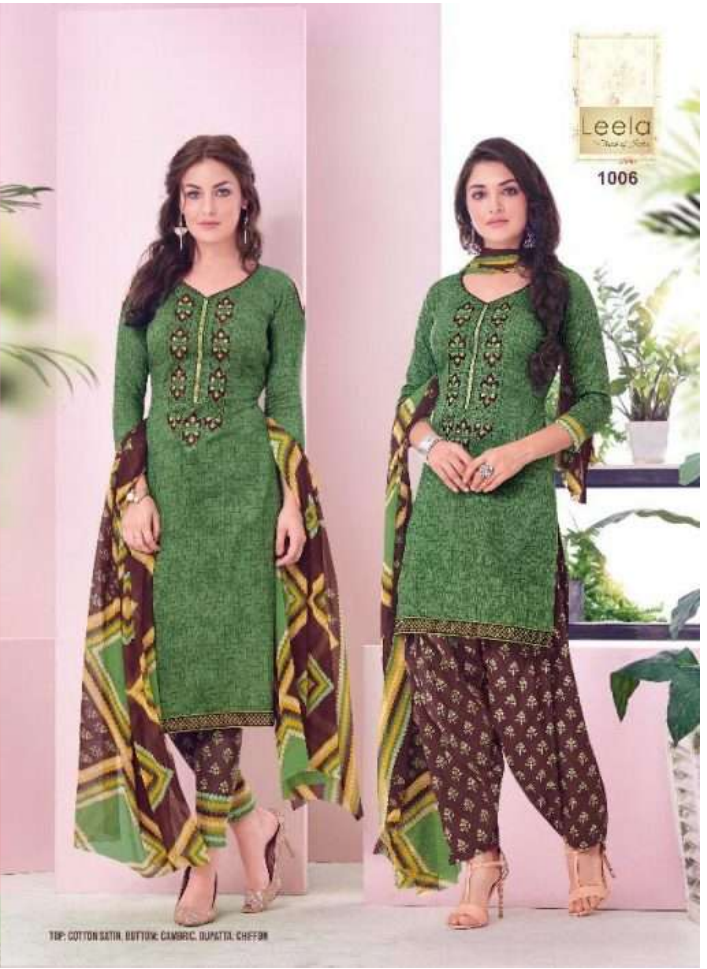
TOP: COTTON SATIN, BOTTOM: CAMBRIC, DUPATTA: CHEFON