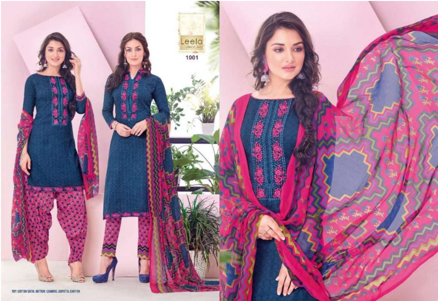
TOP: COTTON SATIN, BOTTOM: CROMBIC, DUPATTA: CHEFION