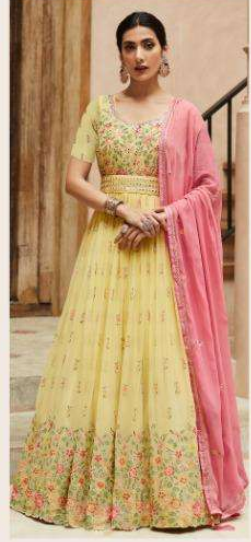
D.no - 9450