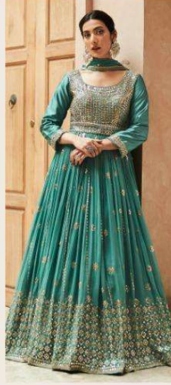
D.no - 9449