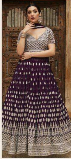
D.no - 9448