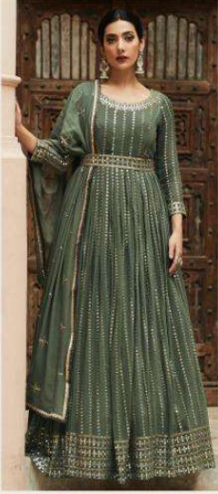
D.no - 9447