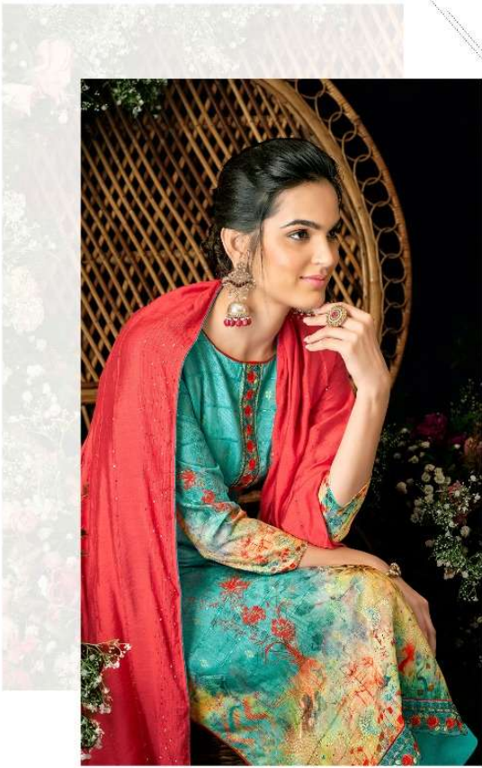
Classic outfits with a hint of intricate detailing, subtle sheen, rich texture is perfectly wrapped in parache giving style a new meaning and refresh your wardrobe to Indian culture.