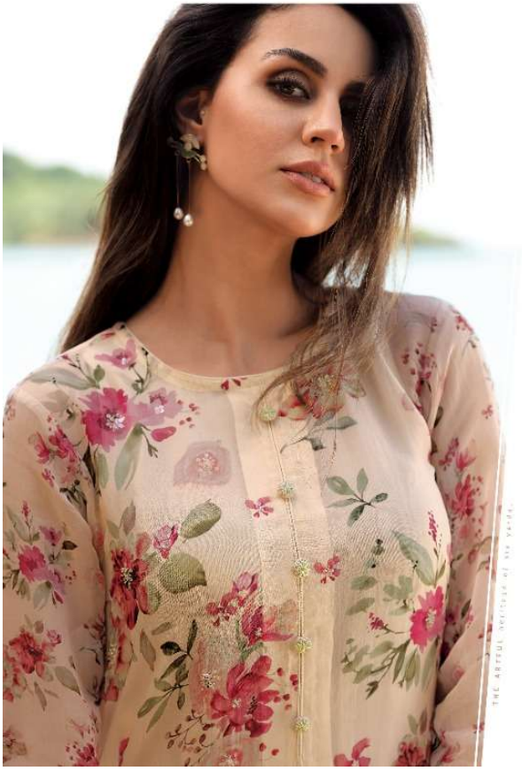
THE ARTFUL WEAVE OF SOFTNESS