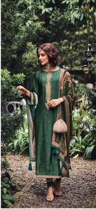
LOOK PRESENTLY GORGEOUS WITH THIS EXQUISITE COLLECTION THAT ECHOES SENTIMENTS OF STRENGTH AND INDIVIDUALITY.