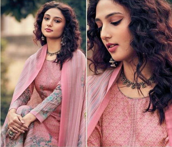
Qaddam || 565

FASHION CAN BE BOUGHT STYLE ONE MUST POSSESS