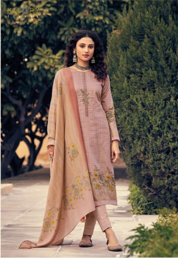
Qaddam || 568