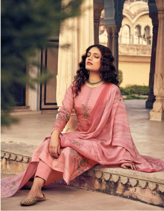
Qaddam || 566