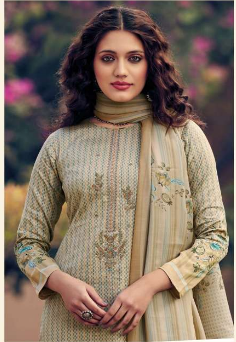
Qaddam || 567