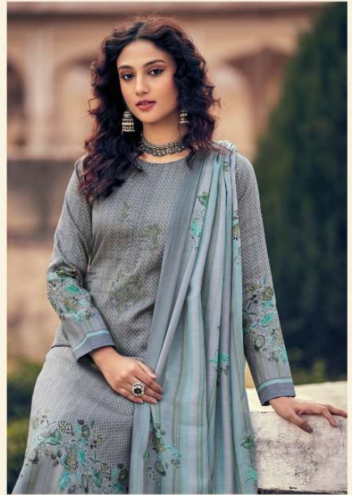
Qaddam || 561