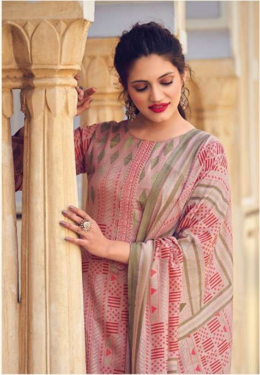
• DISTINGUISHING Style •