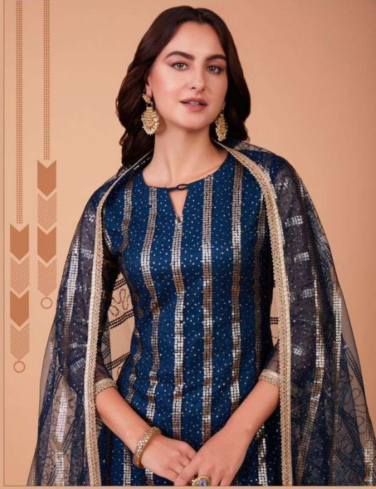
LET'S LOVE FASHION 229