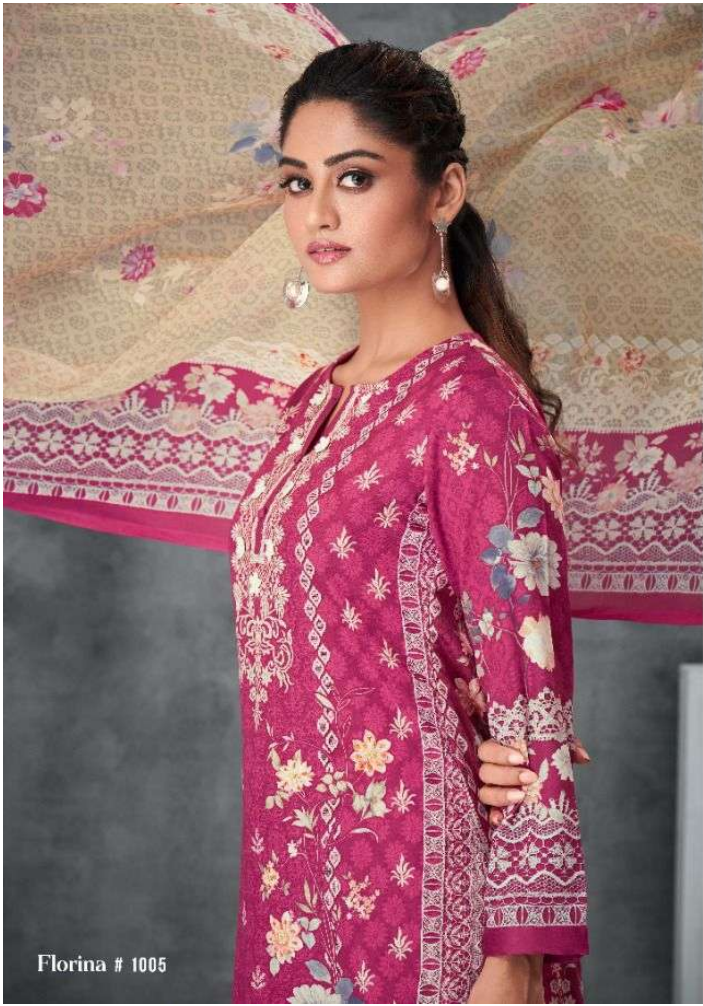
Florina # 1005