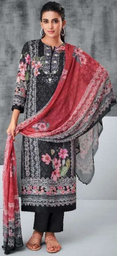
Florina # 1004