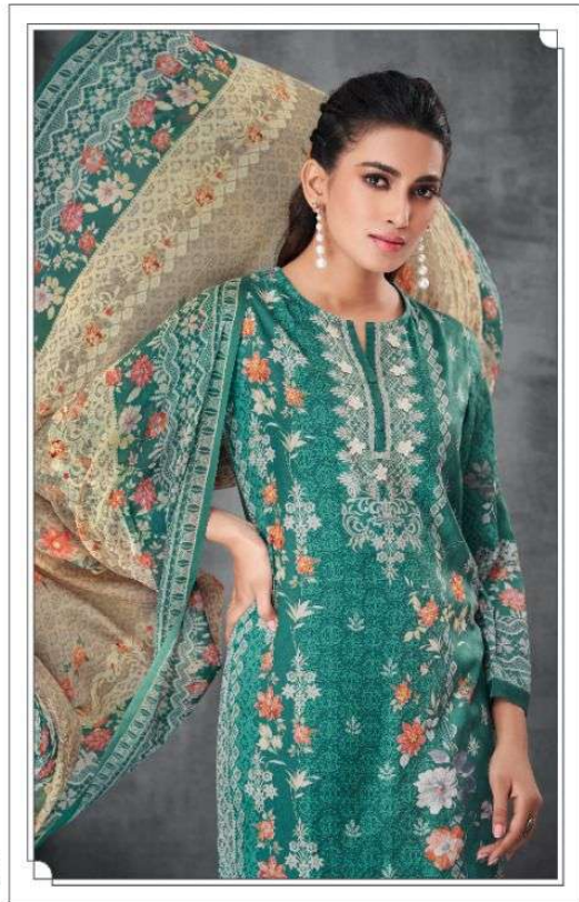
Florina # 1006