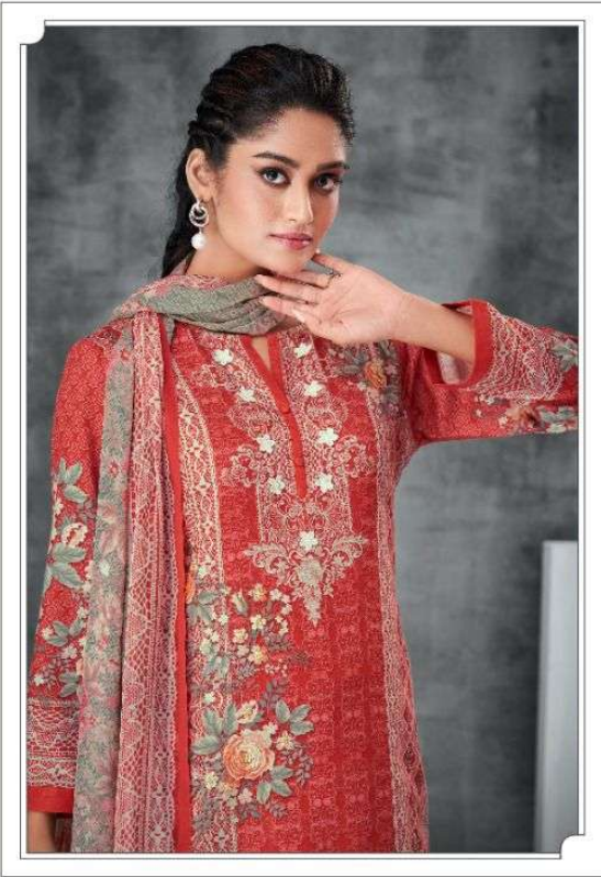
Florina # 1001