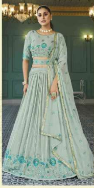
CODE : 172