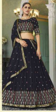
CODE : 173