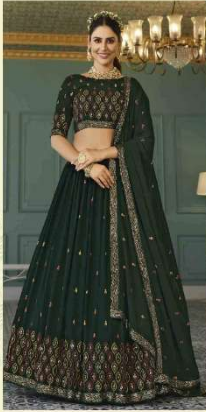
CODE : 175