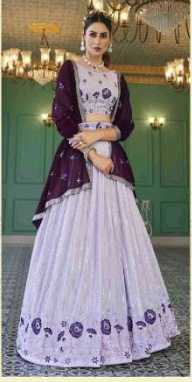
CODE : 171