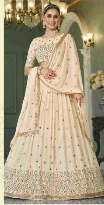
CODE : 176