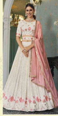
CODE : 174