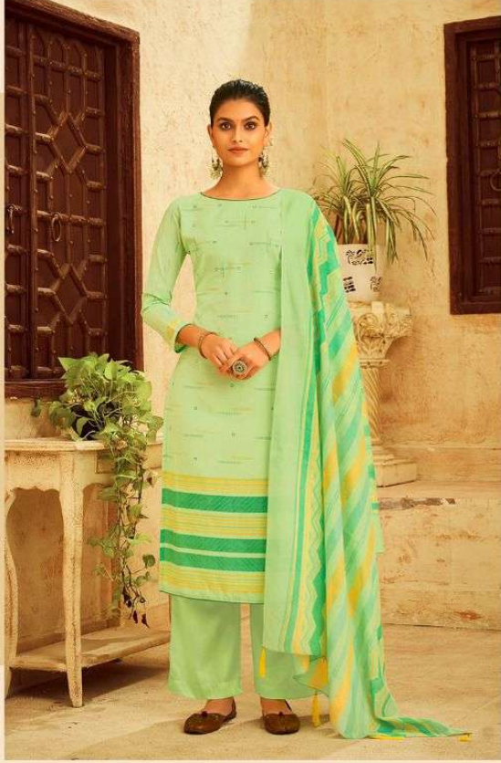
EXCLUSIVE DESIGNER LOOK FOR THE FESTIVE SEASON 1003