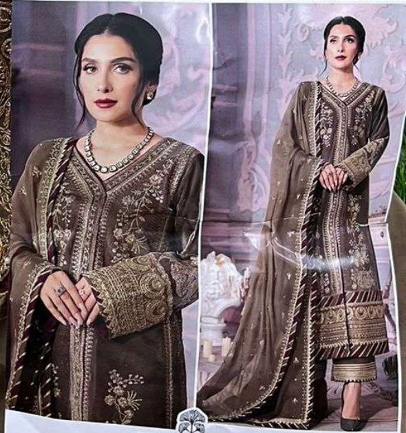
ZAHA D.No.10119 TOP Fox Georgette with Embroidery BOTTOM-INNER Dull santoon DUPATTA Nazmin Embroidery