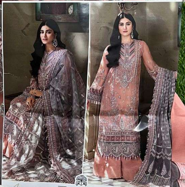
ZAHA D.No.10118 Fox Georgette with Embroidery BOTTOM SHAWL PATA Nazmin with Embroidery