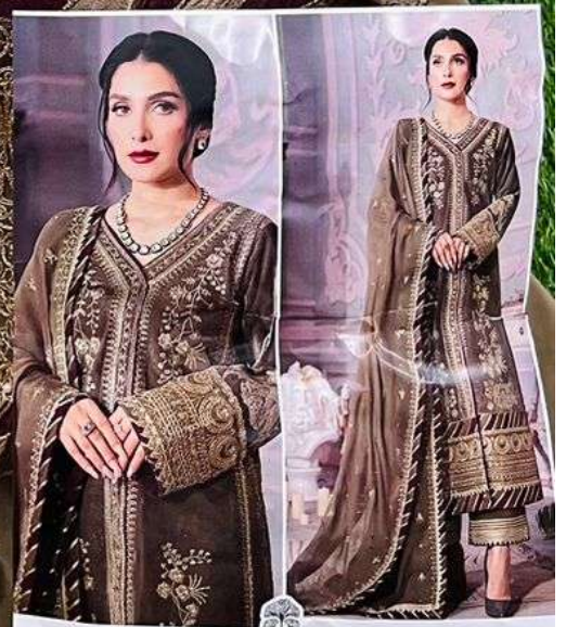
ZAHA D.No.10119 TOP Fox Georgette with Embroidery BOTTOM Quilt Lantoon DL