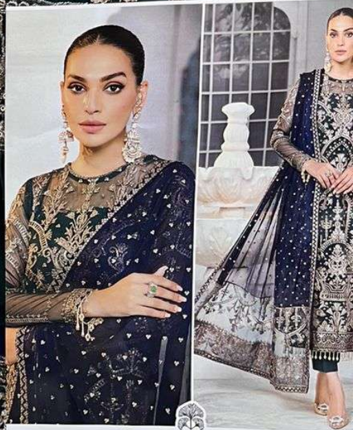
ZAHA D.No.10117 TOP Fox Georgette with Embroidery BOTTOM-INNER Dull santoc