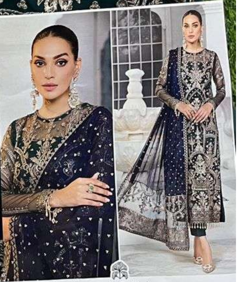
ZAHA D No. 10117 TOP Fox Georgette with Embroidery BOTTOM INNER [unclear]