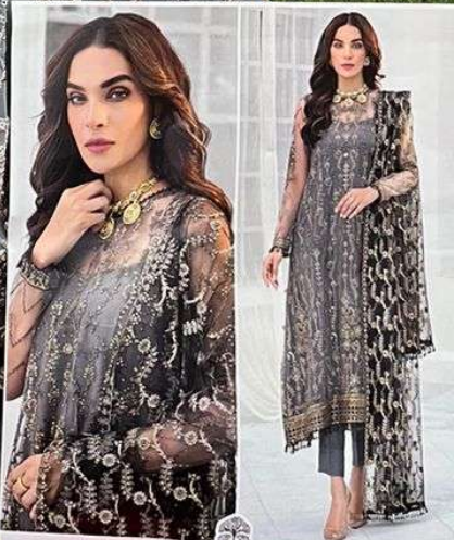
ZAHA D.No.10116 TOP: Butterfly Net with Heavy Embroidery BOTTOM: INNER: Dull saree DUPATTA: Butterfly Net with Heavy Embroidery