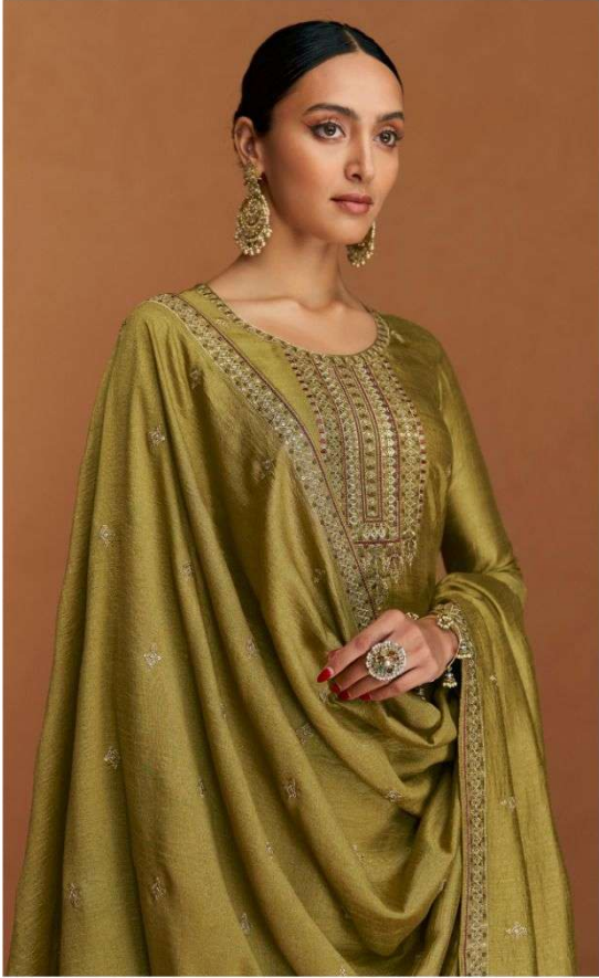
A | 0550