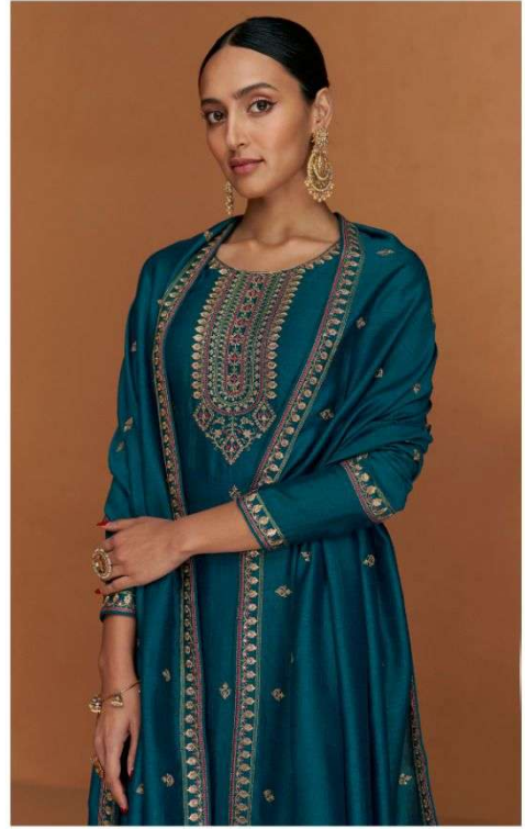
A | -9548