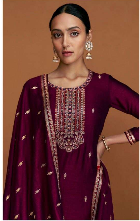
A | - 9553