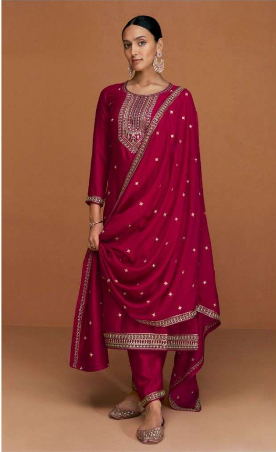
A | -9551