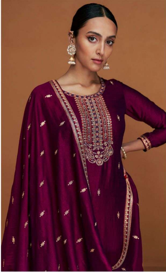
A - 9553