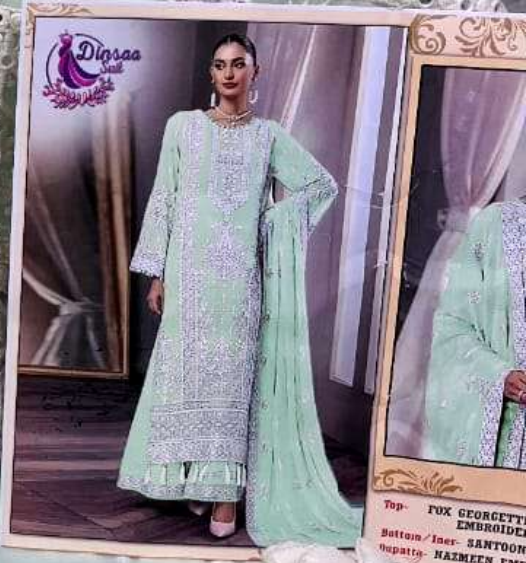
Top- FOX GEORGETTE EMBROIDER Bottom / Jaser- SANTOON Dupatta- HAZMEEN LMB