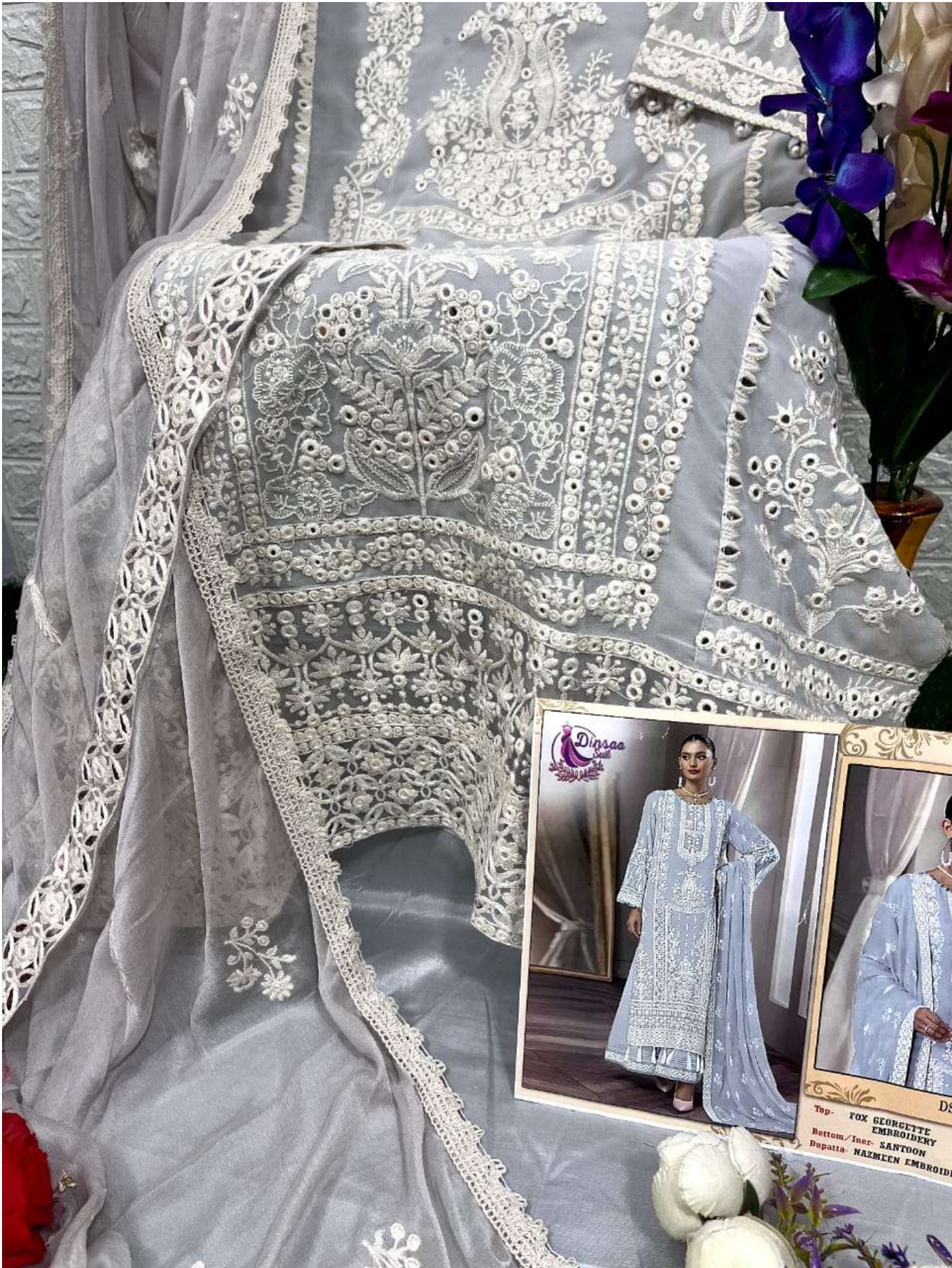
Dipsaa Top- FOX GEORGETTE EMBROIDERY Bottom/Inner- SANTOON Dupatta- NAZMIEN EMBROID D8