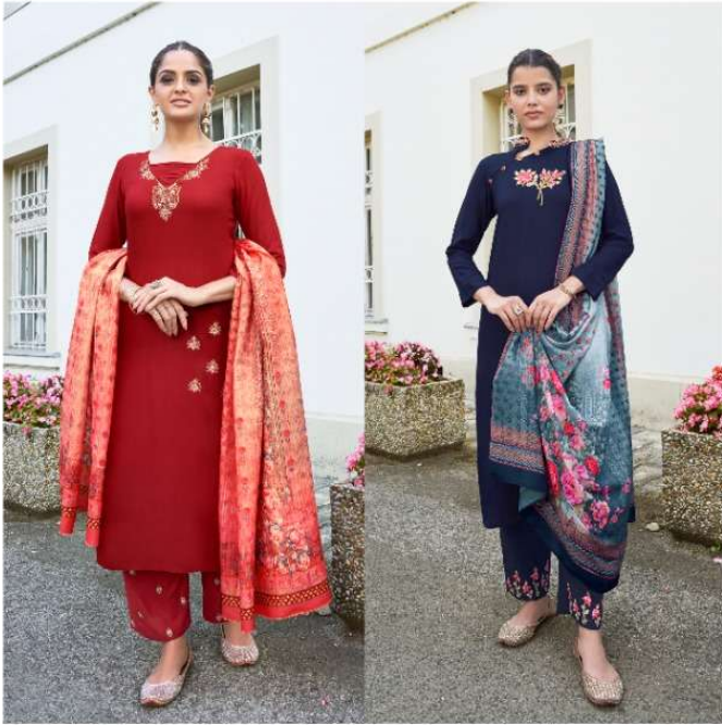
⇐ 19004 ⇐