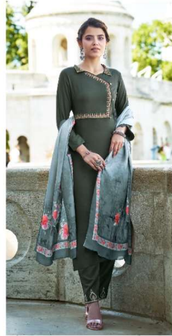
⇐ 19006 ⇐