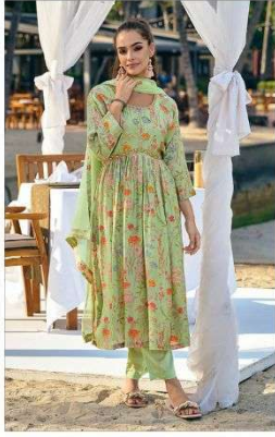
— 40043 —