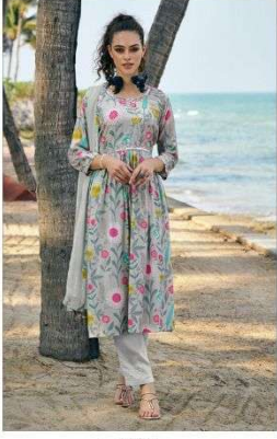
— 40041 —