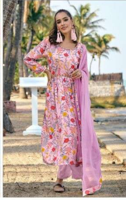
— 40044 —