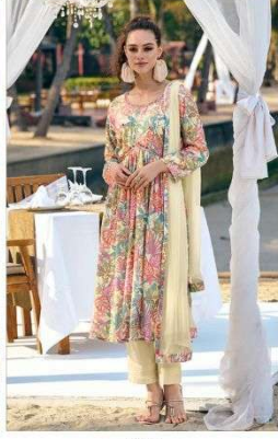
— 40042 —