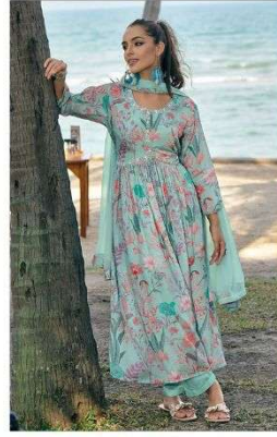
— 40046 —