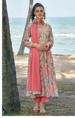
— 40045 —