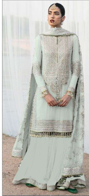
S - 98 B