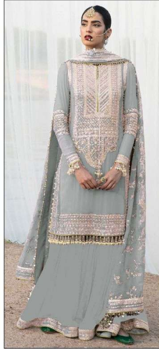
S - 98 C