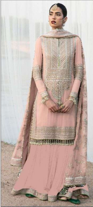
S - 98 A

TOP - FOX GEORGETTE EMBROIDERD WITH HAND WORK BOTTOM- HEAVY SANTOON WITH LACE WORK INNER - HEAVY SANTOON DUPATTA - NAZNEEN HEAVY EMBROIDERED WITH FOUR SIDE LACE WORK