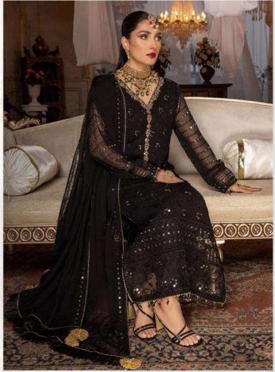
It is their dream to be in new trends and style whether it is traditional ones or modern ones or sometimes mixture. In India the girls more prefer to wear traditional ones where the comfort feature concerned as salwar kameez.