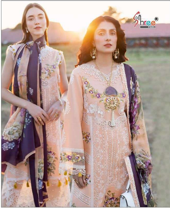
MUSHQ Luxury Lawn Collection-23