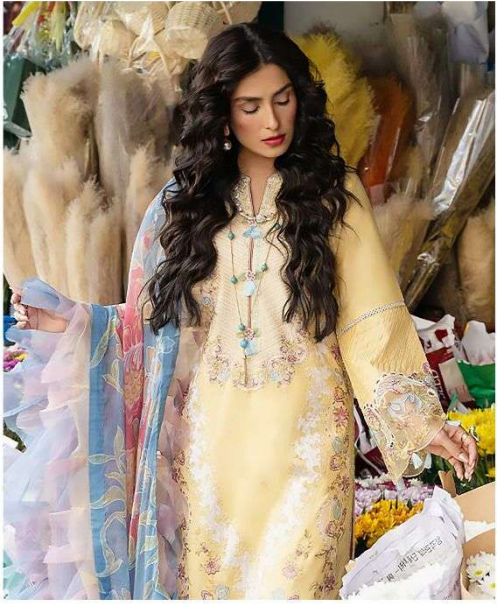
MUSHQ Luxury Lawn Collection-23