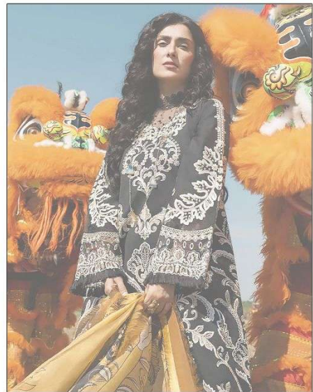
MUSHQ Luxury Lawn Collection-23