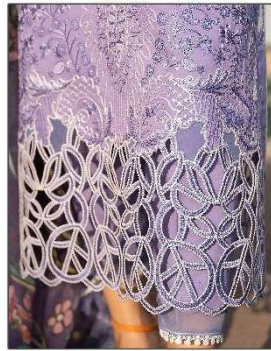
MUSHQ Luxury Lawn Collection-23