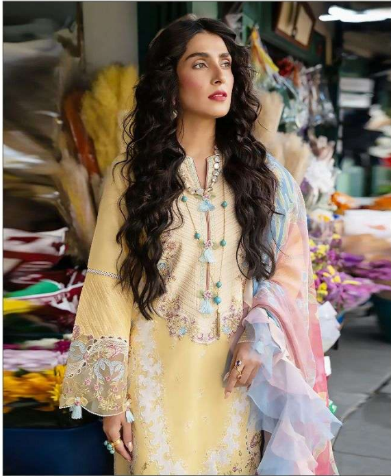
MUSHQ Luxury Lawn Collection-23