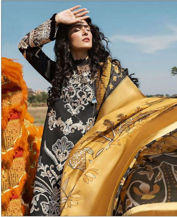
MUSHQ Luxury Lawn Collection-23