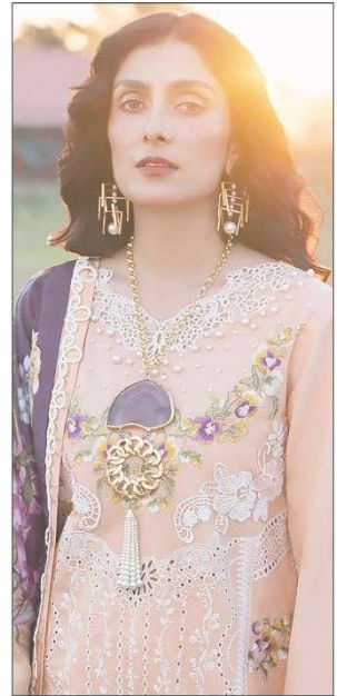
MUSHQ Luxury Lawn Collection-23