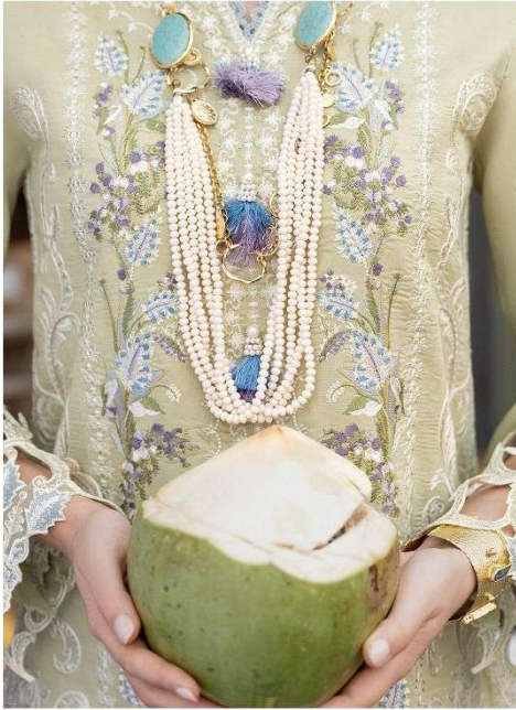
MUSHQ Luxury Lawn Collection-23