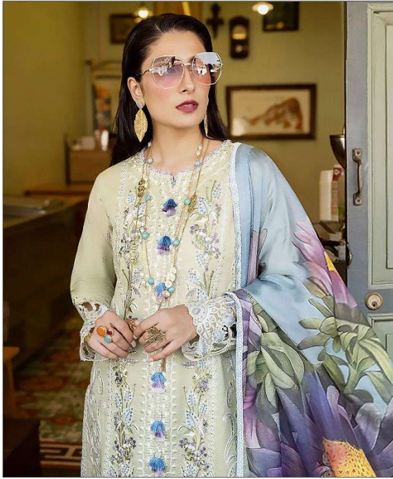
MUSHQ Luxury Lawn Collection-23