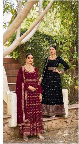
Iskhan is about elegance, grace and style. It is about beauty, it is about the joy of wearing it, it is about the joy of wearing it, it is about the joy of wearing it.