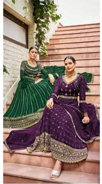
Lehenga should be simple. A hat will appreciate ourselves, you do not have to wear a hat for the lehenga.