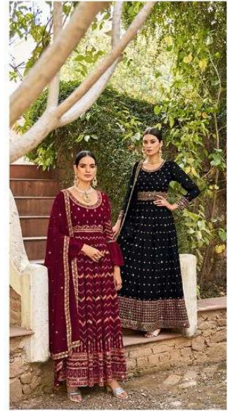
Iskhan is about elegance, grace and style. It is about being the best in the world. It is about being the best in the world.