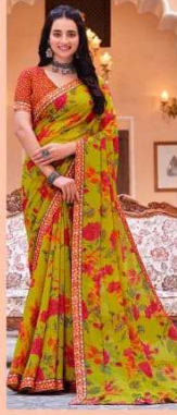
64505 (WITH STONE WORK)