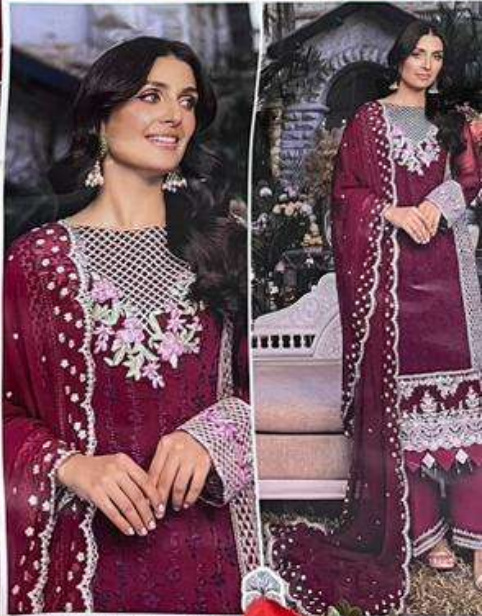
KHUSHBU Vol-5 TOP Faux Georgette with Embroidery Z BOTTA No.10137