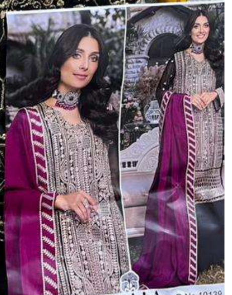
KHUSHBU Vol. 2 TOP Faux Georgette with Embroidery ZAHA D.No. 10139 DUPATTA Namika Embroidery BOTTOM-INNER Dual Satton