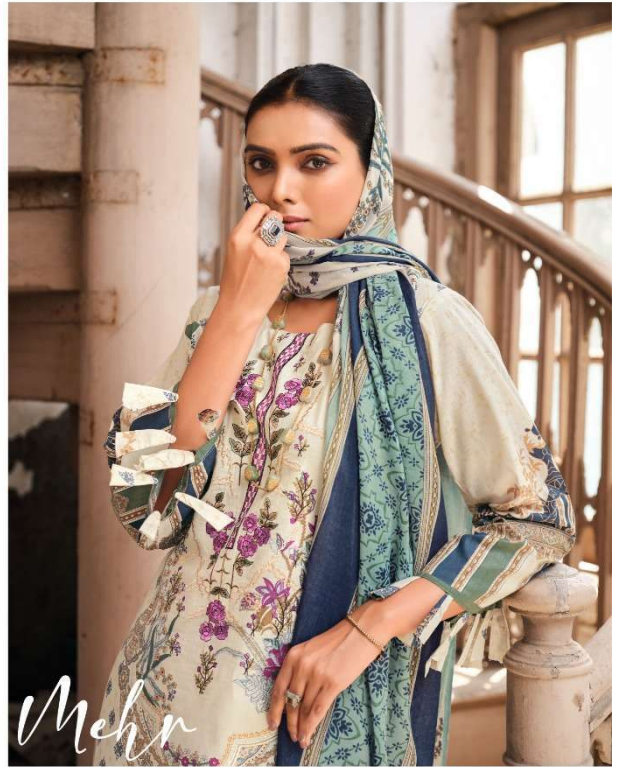
Sweet spring is your which bring a whole new range of variety. 776-001