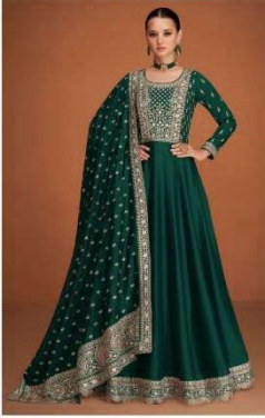
A | 9577