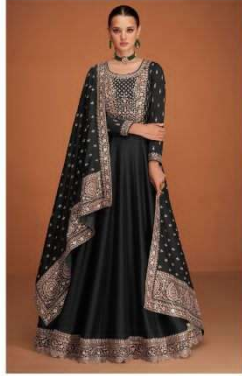
A | 9578