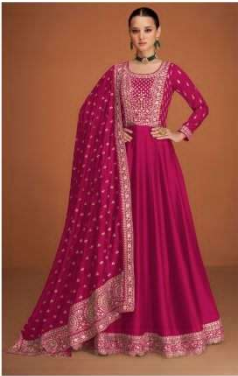
A | 9579