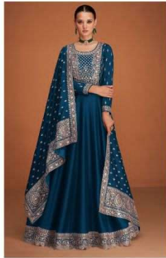
A | 9580