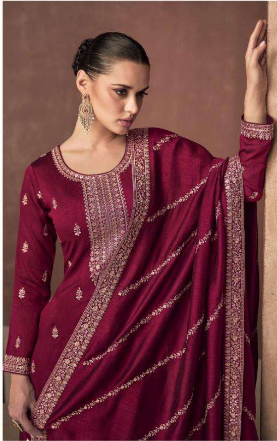
A - 9586