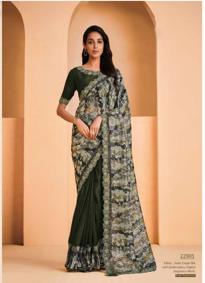
22905 Fabric : Satin Crepe Silk with Embroidery, Digital Sequence Work. www.ajayilifestyle.com