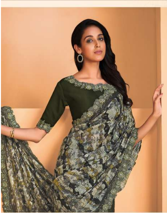
Frolic Splashing Green It is not about dressing according to what's fashionable. You just proved that style is more about being yourself.