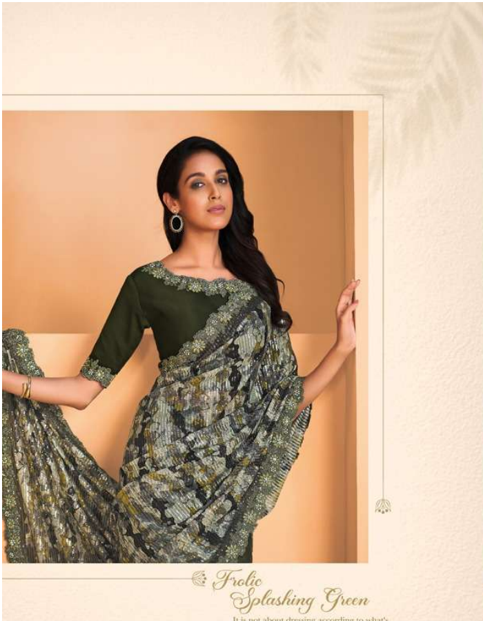
Frolic Splashing Green

It's not about dressing according to what's