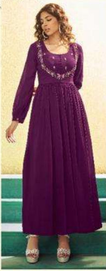
| 1031 |