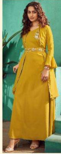
| 1034 |