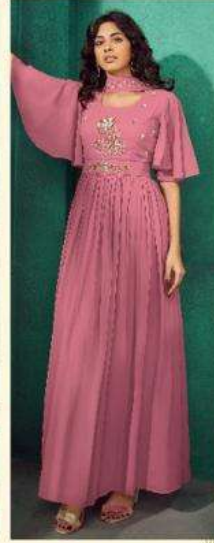
| 1035 |