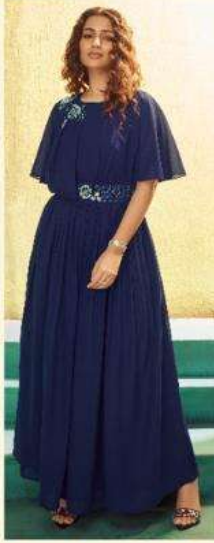
| 1032 |