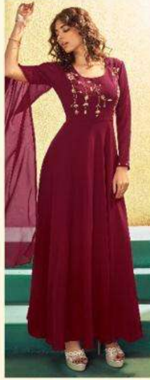
| 1033 |