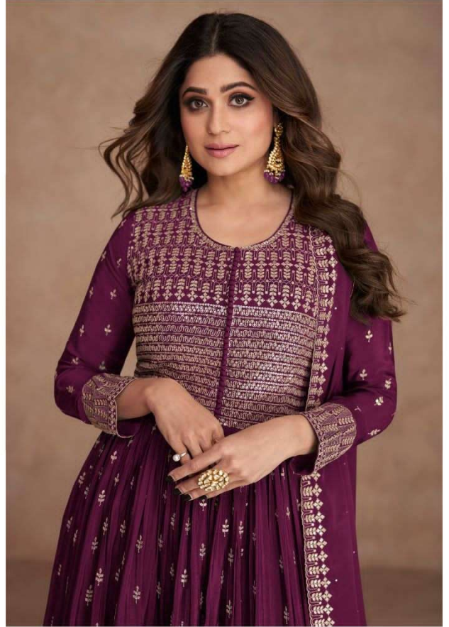
A | 9542