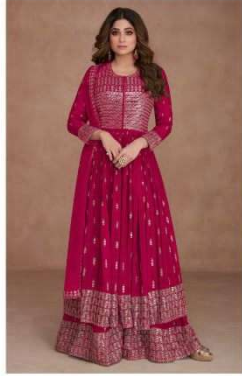
A | 9539