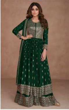
A | 9538