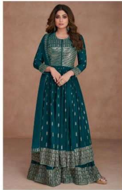
A | 9541