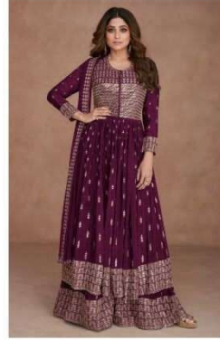
A | 9542