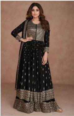
A | 9540