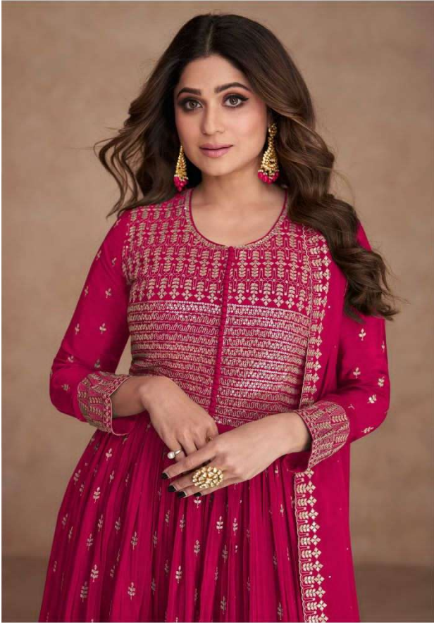
A | 9539