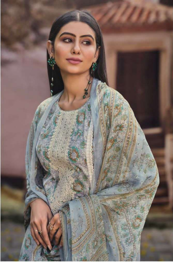
SHADES OF BEAUTY 10384