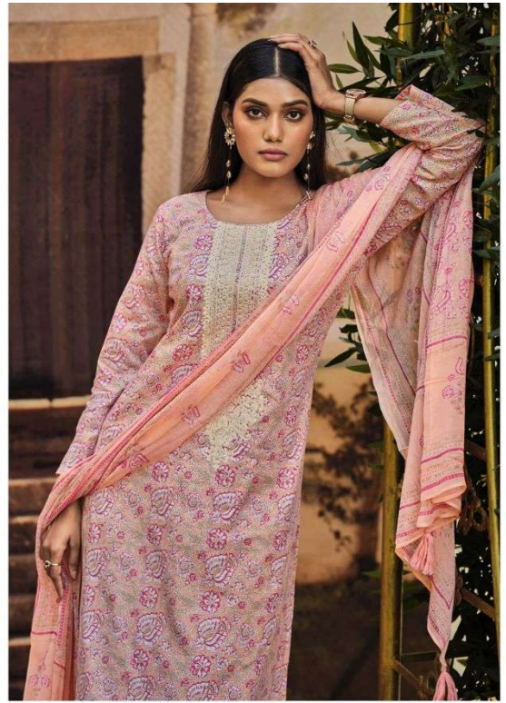
SHADES OF BEAUTY 10388