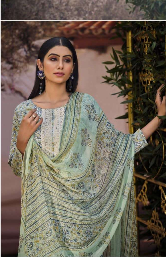
SHADES OF BEAUTY 10390