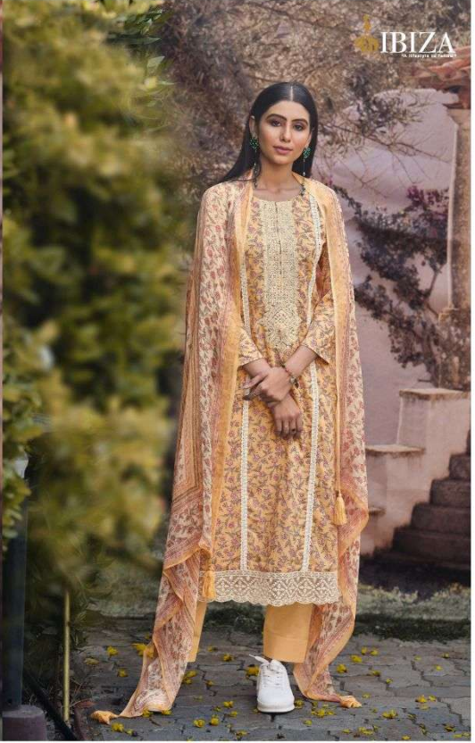
SHADES OF BEAUTY 10389