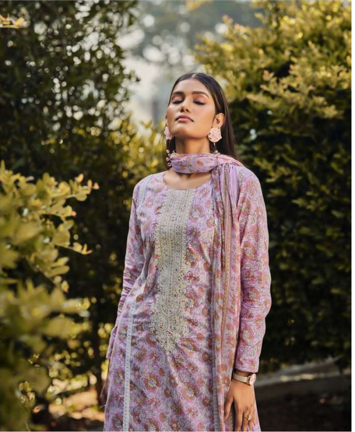
SHADES OF BEAUTY 10385