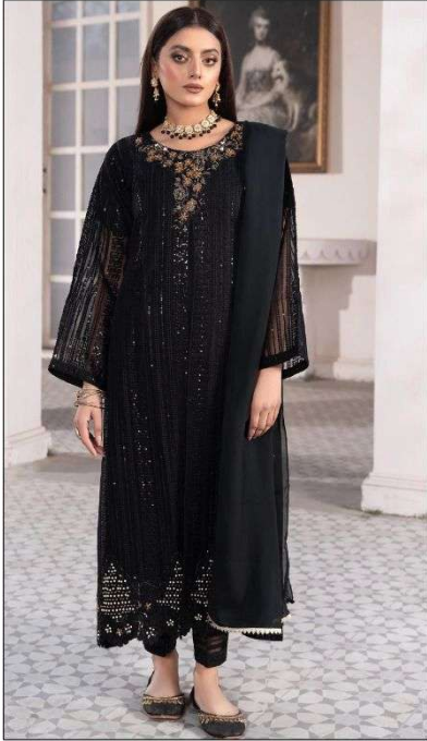
S - 122 A