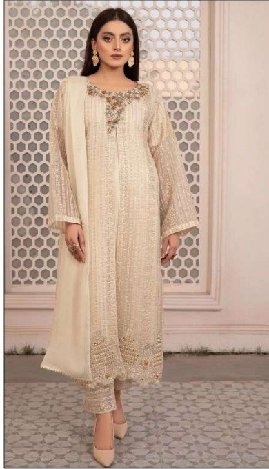
S - 122 B