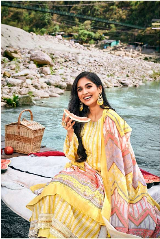
D.NO. 1002 DREAMY DRAPES