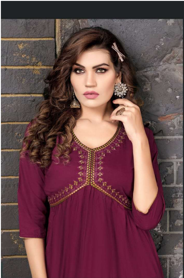
this tradition true gets a whole new look with seductive silhouettes

flights of fancy there is beauty in all things you just need to look close enough. style is a simple way of saying complicated things