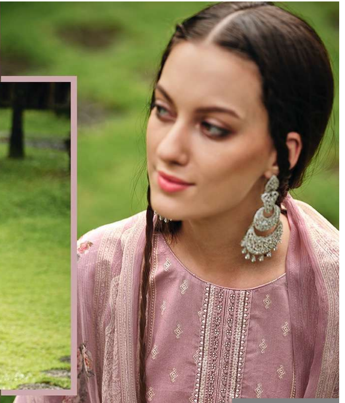
It is said that you cast a spell on one and all. When they behold the first glimpse of you, they simply can't look away. Many wonder, about and to themselves, what magic spell is it all your charmed, that we feel them in the power of your eye. Dressed with designs that enchant and amaze all.