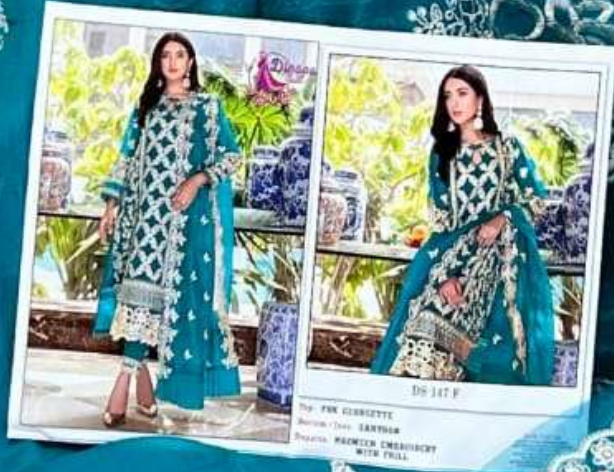
THE PINK CLOSETTE Material: Silk / ARTISAN Product: HANDMADE CRAFTSMANRY WITH FULL