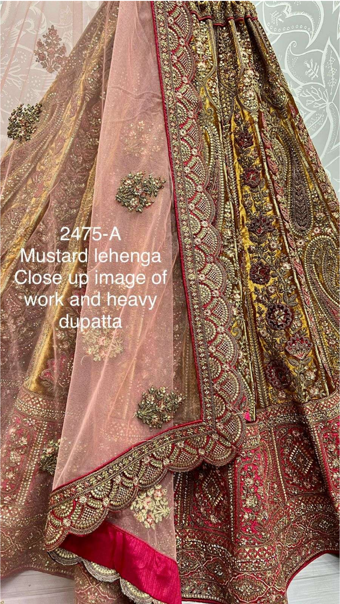
2475-A Mustard lehenga Close up image of work and heavy dupatta