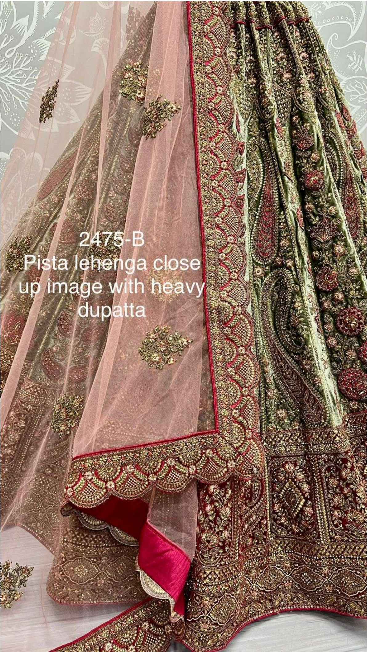
2475-B Pista lehenga close up image with heavy dupatta