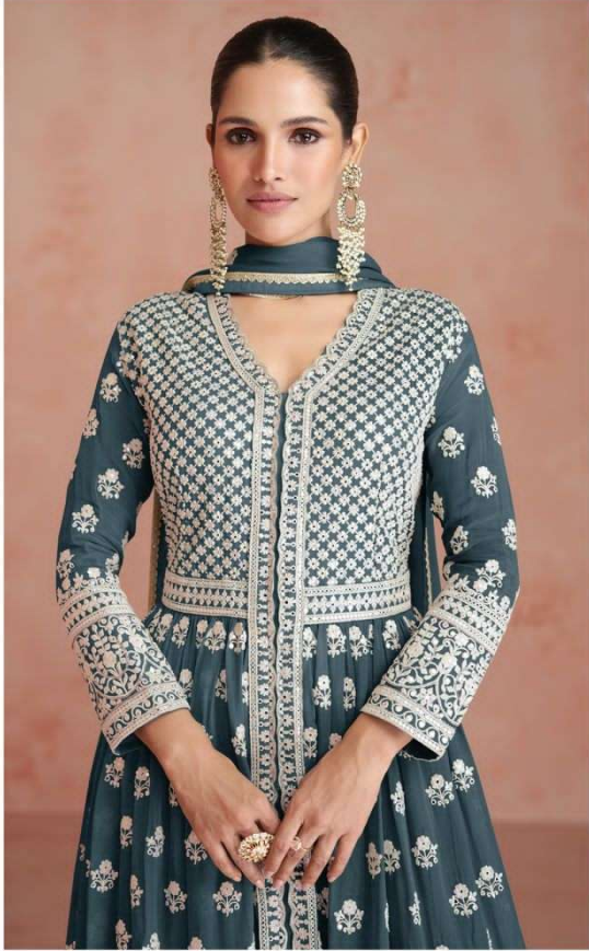
A - 9601